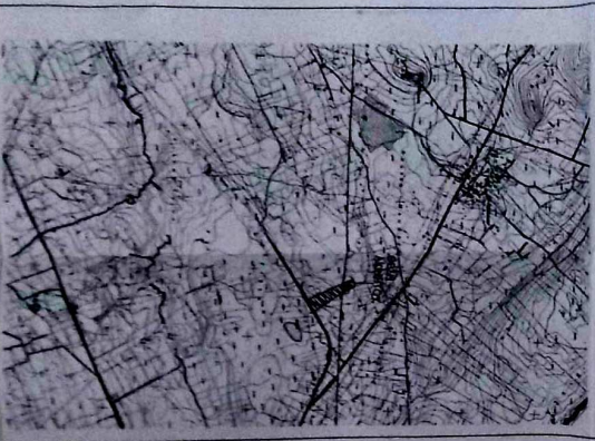
ΑΝΤΙΚΕΙΜΕΝΑ ΑΝΑΝΤΙΣΤΟΙΧΙΑ ΤΥ ΕΣΣΣ Α Κ ΕΣΣΣ Β