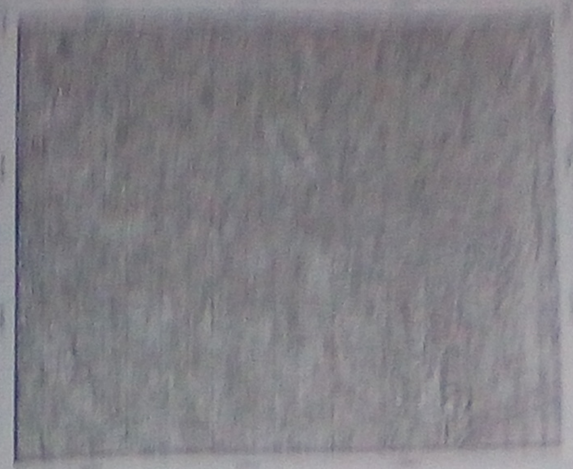
Diagram illustrating the structure of a material or biological tissue.

Handwritten notes in blue ink, possibly a signature or date.