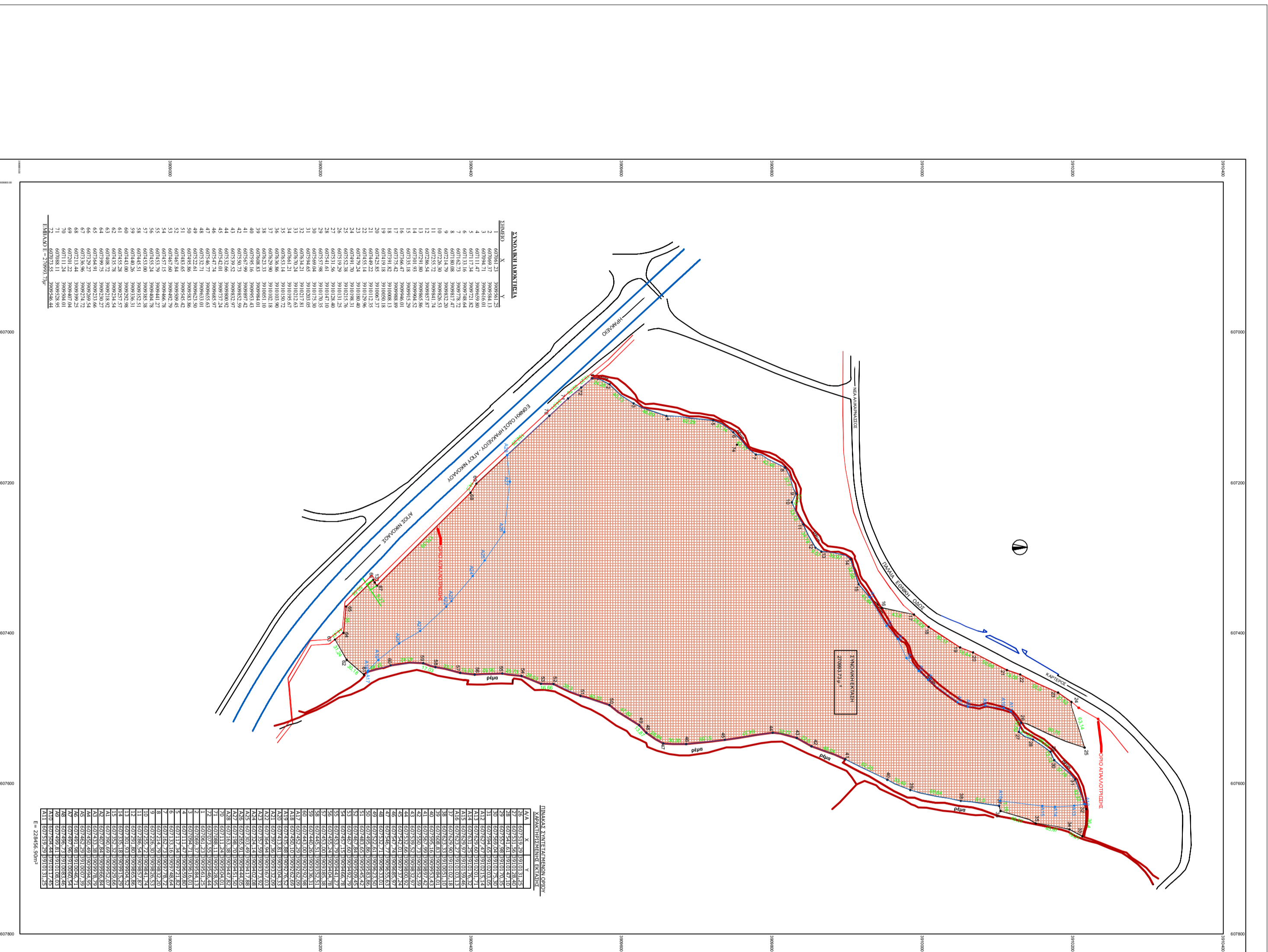
ΣΤΑΘΜΟΙ ΠΡΟΣΩΝ ΣΤΗ ΣΤΡΑΤΗΓΙΑ